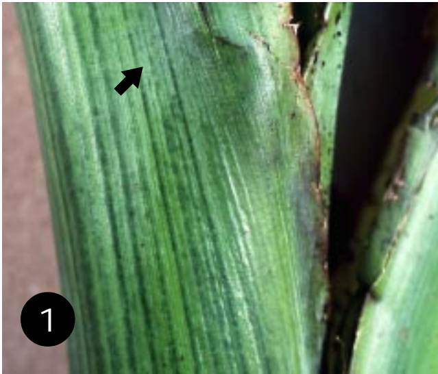
An early symptom of BBTV infection is “Morse code streaking” on the leaf stem (petiole).