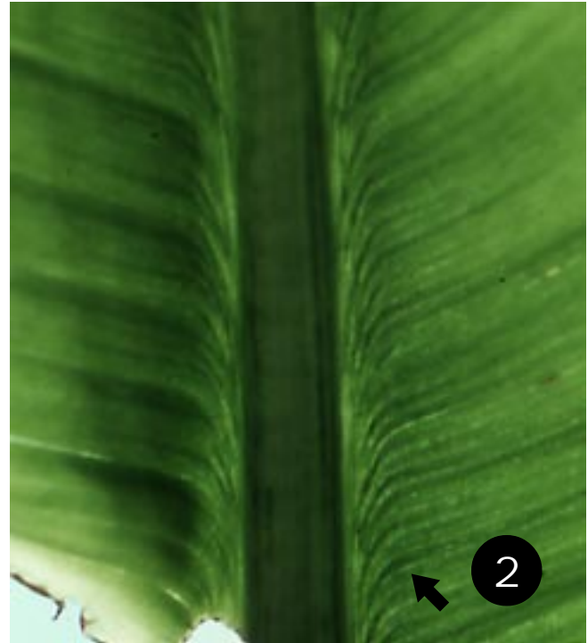
The “hooking” symptom of BBTV, where the veins of the leaf blade extend into the normally clear area along the leaf midrib and point down toward the base of the leaf.

Control methods used are likely to vary depending on whether you are a homeowner or a commercial banana grower. Commercial growers may prefer to use pesticides and are usually knowledgeable about their proper use, while homeowners may prefer not to use pesticides.