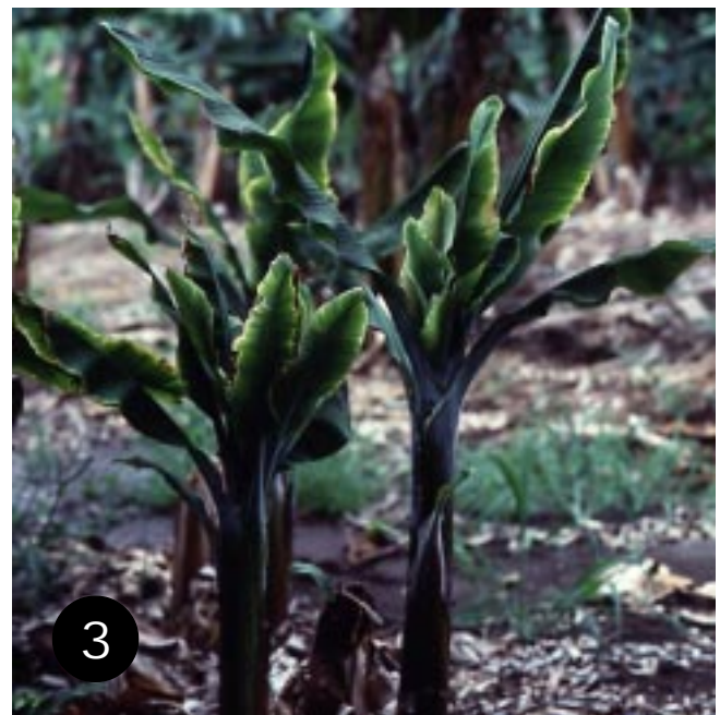
Young banana plants showing advanced symptoms of BBTV, including yellowed leaf margins and narrow, stiff, erect leaves “bunched” together at the top of the stem.

Aphids can be killed by spraying them with soapy water, and some insecticidal soaps are legally registered as pesticides. Insecticidal soaps have the advantage of being relatively non-toxic to people, birds, and other animals. The spray solution should be directed to the places where the aphids are most likely to be hiding or feeding. This includes the leaf petioles and the “pockets” where the petioles separate from the pseudostem. In particular, aphids can be found feeding on young suckers and down inside the whorl of the latest, unfurled leaf. After spraying the aphids, do not disturb the plant until the next day.