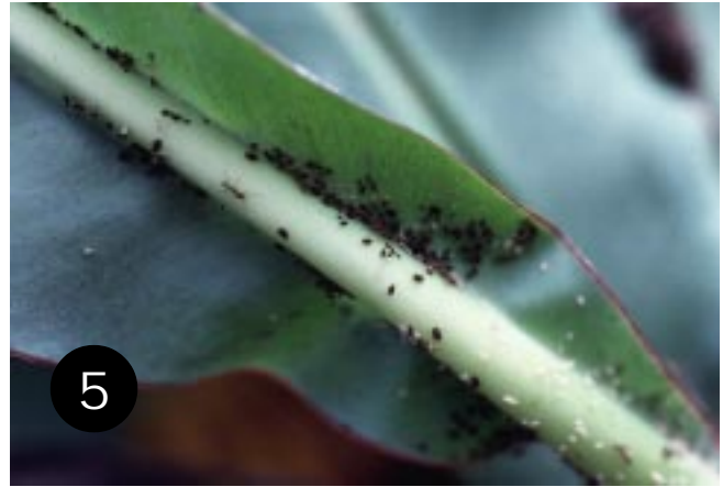
Aphids and ants, which tend them, on the petiole and lamina of the underside of of a young banana plant leaf.

Several commercial insecticidal soaps are registered for use in Hawaii. Consult your local garden shop for suitable products. In many situations, home-mixed soap sprays may be as effective as the commercial products, but they may contain additives toxic to plants. In addition, these home remedies are not legally registered as pesticides.